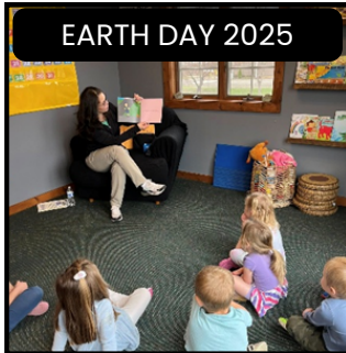
THE CHILD'S PLACE PRESCHOOL